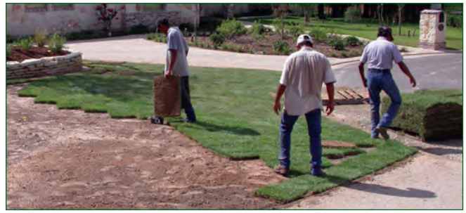
Figure 4. Sod installation.

Sodding. The firm soil surface should be free of footprints, stones, depressions and mounds. Sod is perishable and should be installed within 36 hours of harvest. If you see mildew or yellow grass leaves as you pull the pieces off the pallet, it is evidence of “sod heating” injury, which happens when sod is left on the pallet too long. Do not plant such sod.