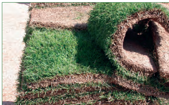
Figure 2. Sod pieces stacked on a pallet awaiting installation.

Sod has traditionally been sold by the square yard, though the trend now is to sell it by the square foot. To determine the amount of sod you will need, measure the square feet of the area to be planted, then divide the total square feet by 9 (the number of square feet in a square yard) to calculate square yards. There are 111 square yards per 1,000 square