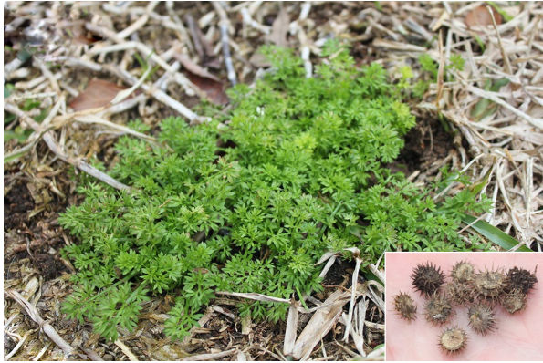
Lawn Burweed Soliva sessilis Ruiz & Pavon