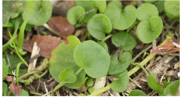
Carolina Dichondra Dichondra carolinensis Michx.