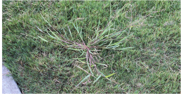
Jungle Rice Echinochloa Colona L.