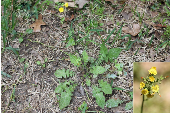
Asiatic Hawksbeard Youngia japonica L.