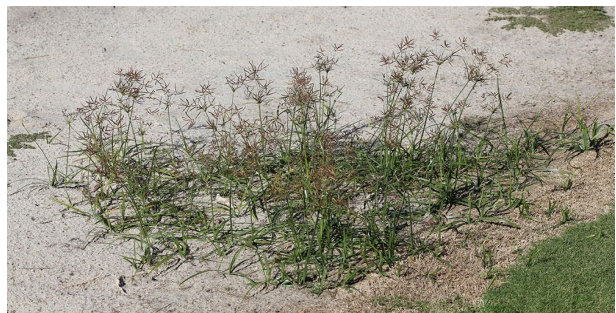
Purple Nutsedge (perennial) Cyperus rotundus L.