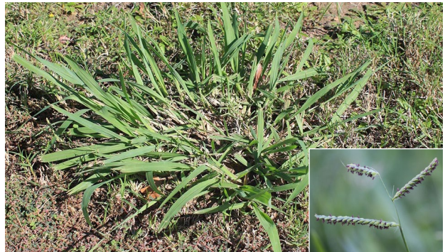
Dallisgrass Paspalum dilatatum