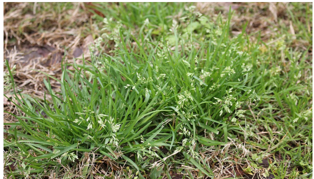
Annual Bluegrass Poa annua