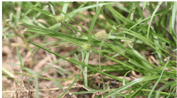
Green Kyllinga (perennial) Kyllinga brevifolia Rottb.