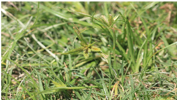
Annual Sedge (summer annual) Cyperus compressus L.