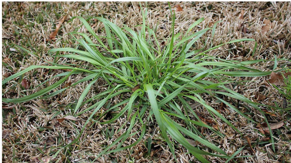
Annual Ryegrass Lolium multiflorum