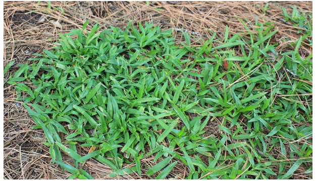
Doveweed Murdannia nudiflora (L.) Brenan