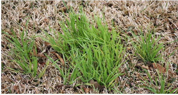
Rescuegrass Bromus catharticus Vahl