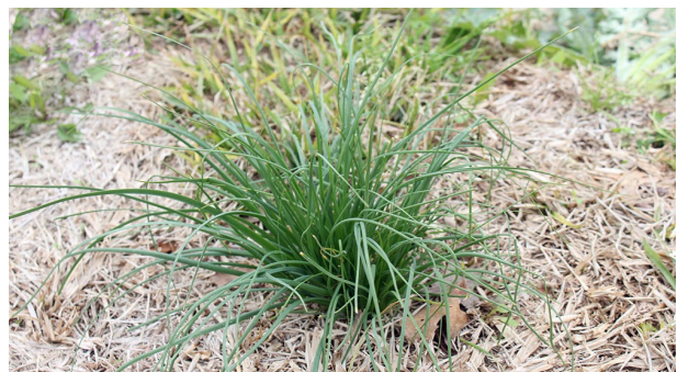
Wild Onion Allium canadense L.