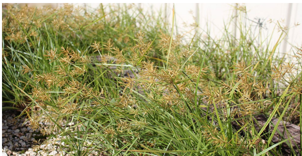
Yellow Nutsedge (perennial) Cyperus esculentus L.