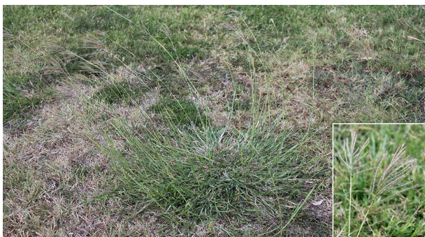
King Ranch ("KR") Bluestem Bothriochloa ischaemum (L.) Keng