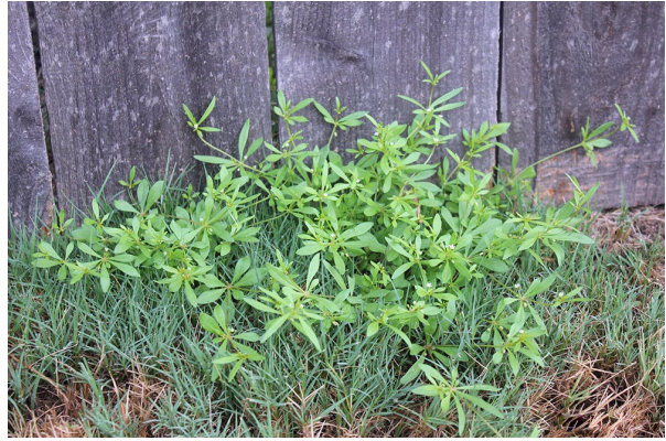
Carpetweed Mollugo verticillata L.