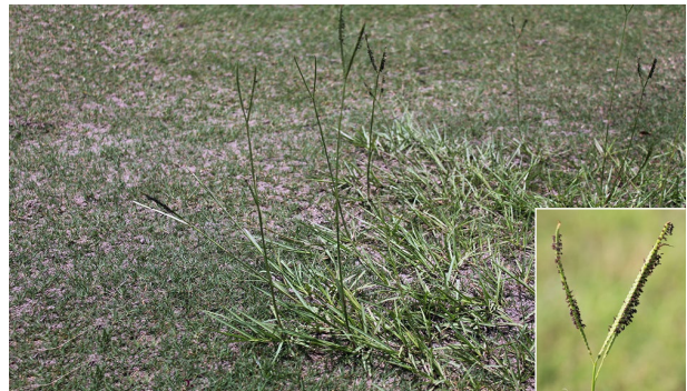
Bahia grass Paspalum notatum Fleugge