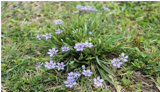
Spring Starflower Ipheion uniflorum (Lindl.) Raf.