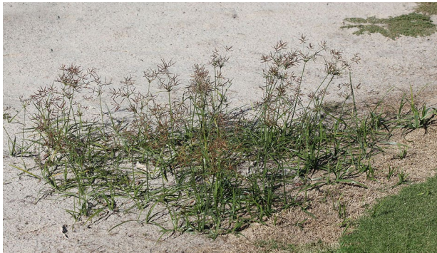
Purple Nutsedge Cyperus rotundus