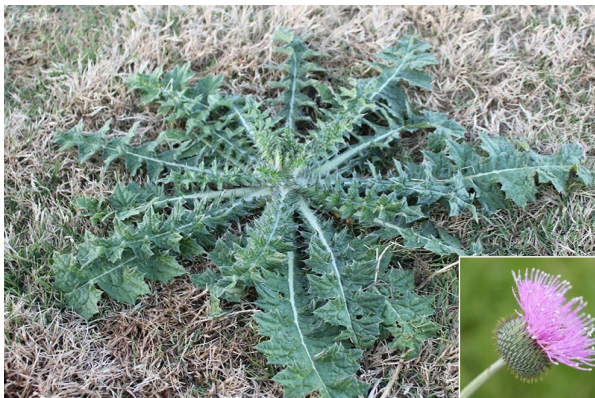
Texas Thistle Cirsium vulgare (Savi) Ten.