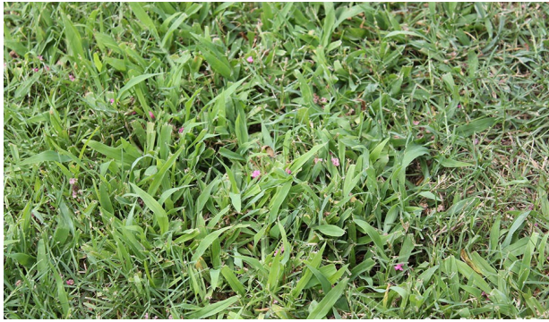
Crabgrass Digitaria spp.