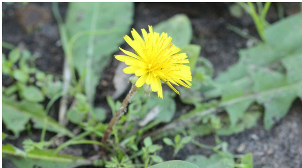
Dandelion Taraxacum officinale F.H. Wigg