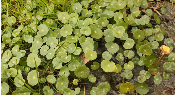
Dollarweed Hydrocotyle sp.