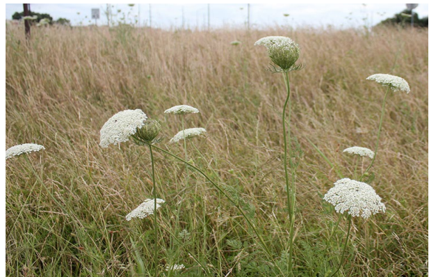
Wild Carrot Daucus carota L.