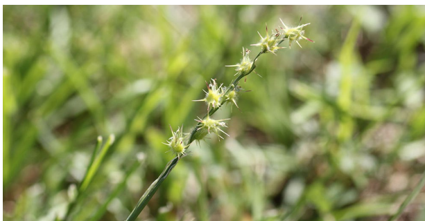
Sandbur Cenchrus spp.