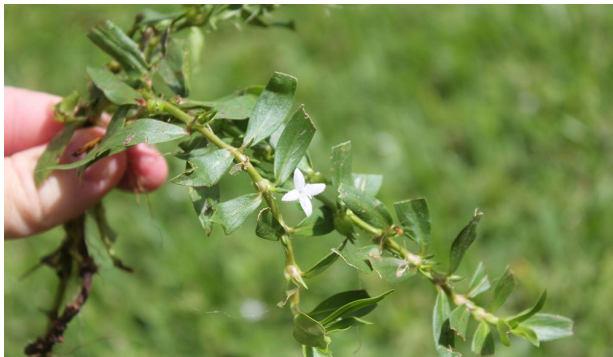
Virginia Buttonweed Diodia virginiana L.