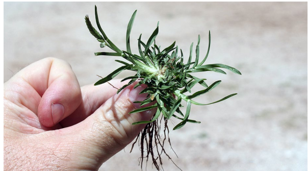
Goosegrass Eleusine indica (L.) Gaertn.