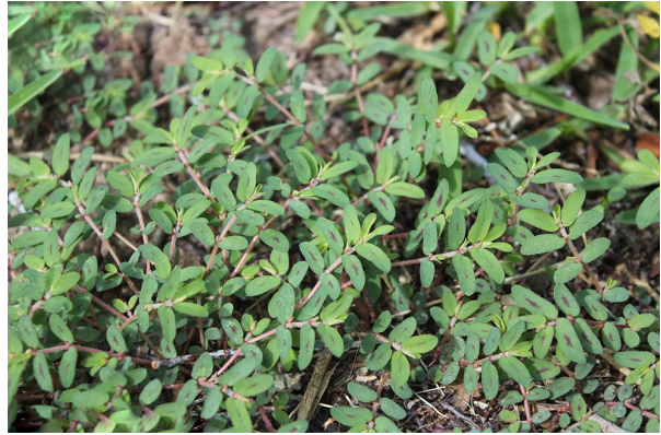
Spotted Spurge Chamaesyce maculata L.