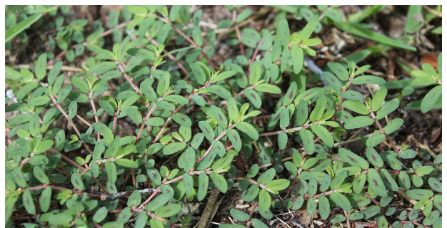
Spotted Spurge Chamaesyce maculata L.