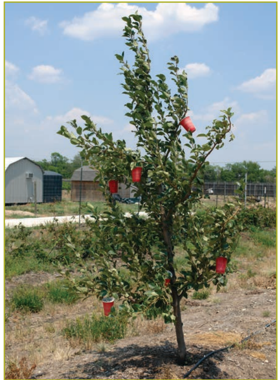
Figure 5. Weights on a pear tree to help spread the limbs and encourage lateral growth.

The main line of defense against fire blight is to choose the correct varieties for your location. However, some fire blight infection is inevitable because high rainfall, especially during bloom or in the heat of sum-