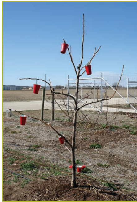
Figure 3b. The tree after pruning and after weights were added to help spread the limbs.