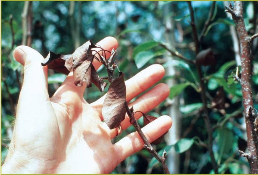
Figure 7. A shoot tip blackened by fire blight.