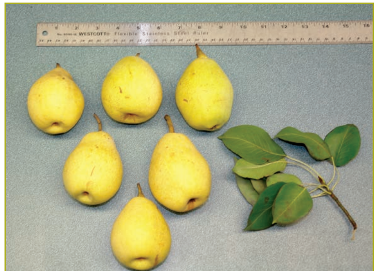
Figure 1. European hybrid pears.

Asian pears derived from distinctly different species such as Pyrus ussuriensis and pyrifolia , which are native to China, Korea, and Manchuria. Varieties include