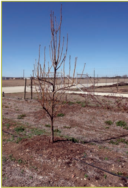
Figure 3a. Third-year dormant pear tree, before pruning.