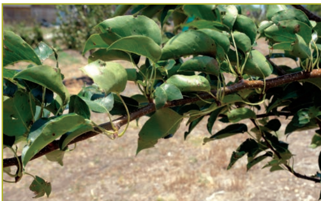
Figure 4. Many short lateral spurs that were encouraged by limb spreading.

Drip irrigation can be used to supply water to trees during the growing season, but after planting, hand water newly planted trees to eliminate air pockets from the planting hole.