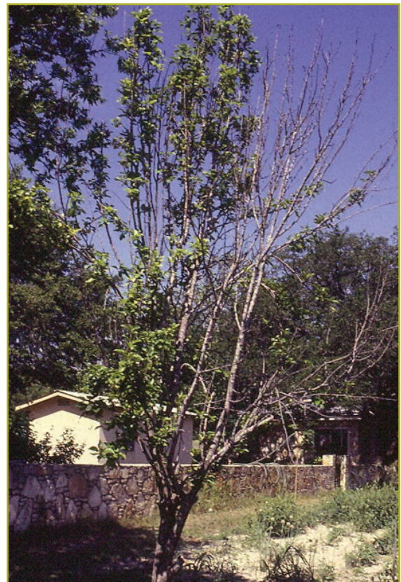
Figure 6. A pear tree damaged by fire blight.