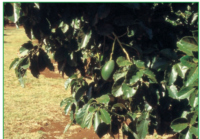
Figure 1. Avocado fruit and leaves.

Hybrids of all three species have created additional varietal types. Blooms form from January to March, with the fruit maturing in as few as 6 months for Mexican types and 18 months for Guatemalan types.