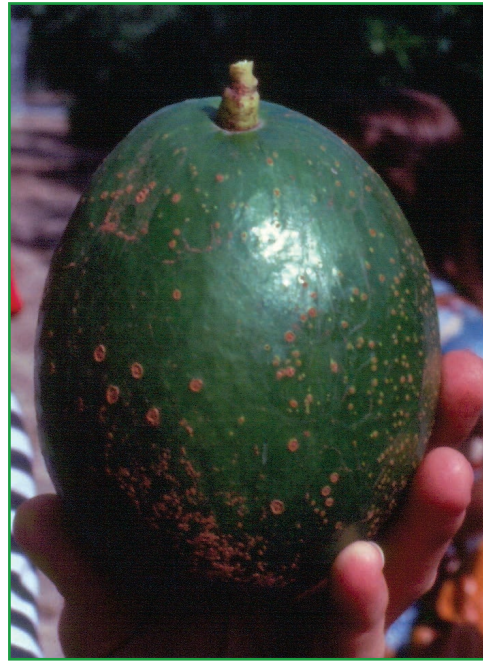
Figure 2. 'Brogdon'.

Mexican varieties grown in Texas include 'Brogdon', (Fig. 2) 'Holland', 'Wilma', and 'Winter Mexican.' 'Lula' is a popular Guatemalan x West Indian hybrid variety grown commercially in the Lower Rio Grande Valley (Fig. 3).