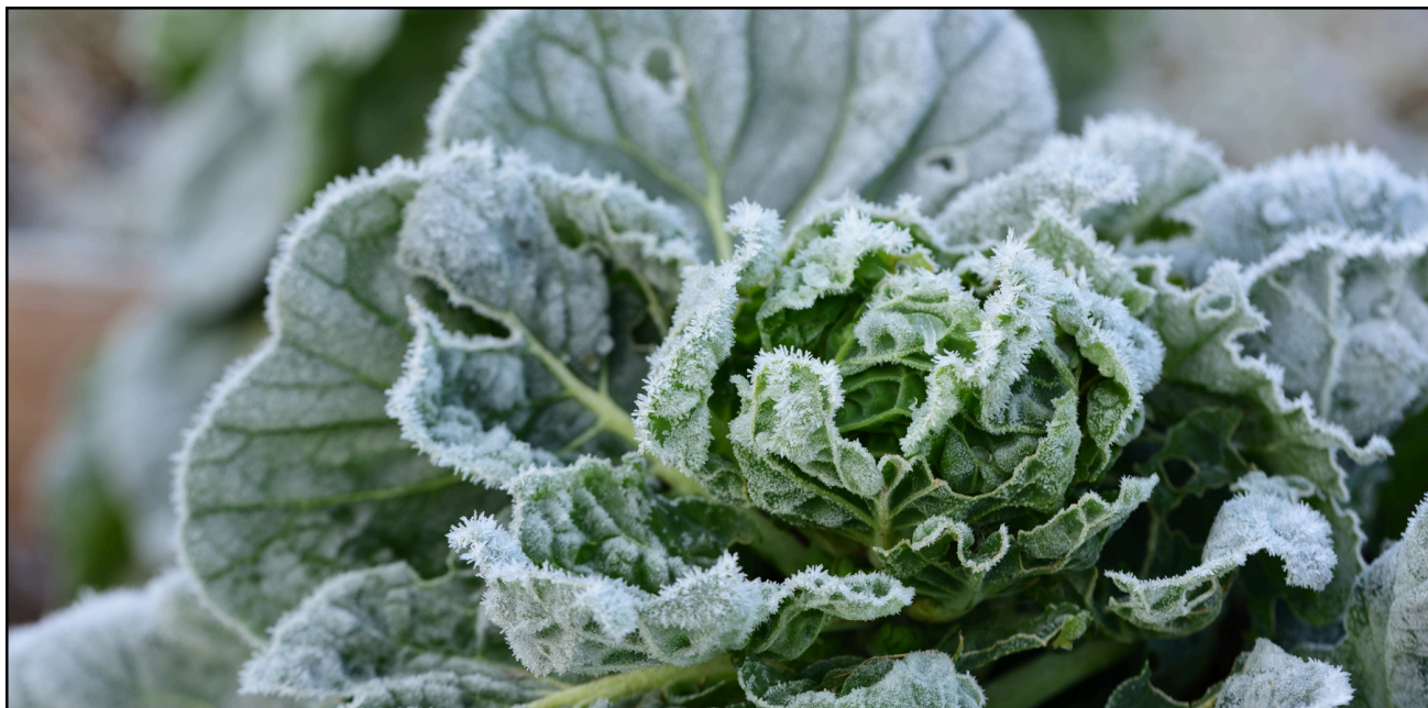
Frozen cabbage in the garden covered with frost