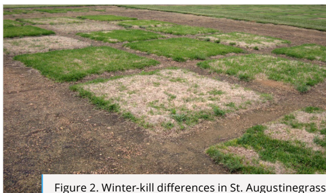
Figure 2. Winter-kill differences in St. Augustinegrass. Credit: Susana Milla-Lewis, Ph.D.

Best establishment guidelines are that warm-season turfgrasses be planted during warmer months when they are actively growing to promote quick and successful establishment. Ideally, St. Augustinegrass should be planted in the late spring and early summer to avoid temperature extremes. This time of year will also often offer greater natural precipitation to aid in establishment compared with drier months in the late summer. While St. Augustinegrass sod can be planted year-round in many parts of Texas, it is important to be mindful of how environmental conditions during other parts of the year may influence the success of establishment. Allow as much time as possible for turfgrass roots to develop prior to fall and winter frosts. St. Augustine is susceptible to winter-kill in some parts of Texas, and successful establishment is vital for winter survival.