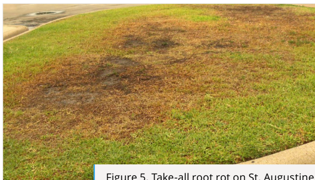
Figure 5. Take-all root rot on St. Augustine.

Take-all root rot is a fungal disease that lives in the soil. With a soil-borne pathogen, cultural practices are the most important aspect for management. Disease activity can be seen throughout the year if turfgrass is stressed but is most prominent when turfgrass is coming out of dormancy in the spring and early summer. Symptoms first appear as chlorotic leaves that eventually turn brown and wilt. As the disease progresses, turfgrass will thin out, leaving brown, irregular-shaped patches that can range from 1 to 20 feet in diameter. Roots of infected grass are usually short, blackened, and rotten; this makes it very easy to lift stolons from the soil. Weakened roots make plants more prone to drought stress. During active disease periods, this fungus usually does not easily transmit on equipment, but limiting the spread of infected plant parts is a good practice. Take-all root rot is more likely to develop under alkaline soil conditions (pH >7). Cultural management includes promoting proper drainage, deep and infrequent irrigation, balancing fertility, and acidifying the soil. Acidifying amendments such as compost, peat moss, and select sulfur-containing amendments can be used independently or when performing cultural practices, such as aerification, to temporarily lower the soil pH to favor turfgrass recovery.