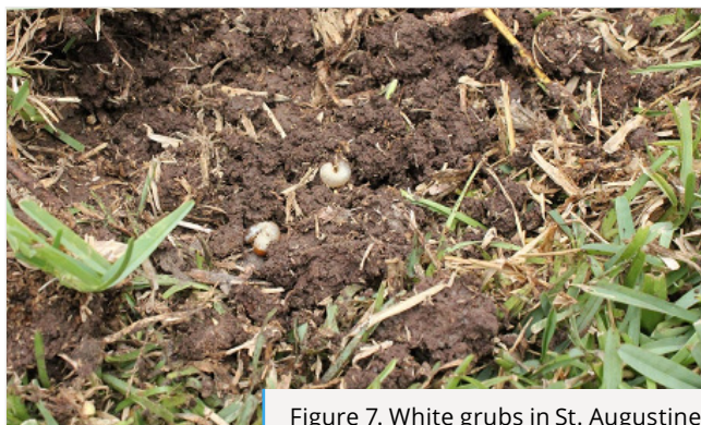
Figure 7. White grubs in St. Augustine.