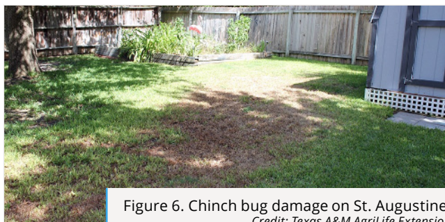
Figure 6. Chinch bug damage on St. Augustine.

Chinch bugs are a common pest of St. Augustinegrass and range in size from approximately 0.2 to 3 millimeters. Chinch bugs are most commonly seen in the summer when the weather is hot and dry. Although all life stages of chinch bugs can be found in the thatch layer, nymphs do damage to the grass by feeding on plant sap and potentially injecting a toxin that will ultimately result in plant tissue death. If this is left untreated, damage can be quite severe and cause large irregular patches of yellow to dead turfgrass. These symptoms can easily be mistaken for drought stress or other disease symptoms. While there is no preventative chemical control of chinch bugs, preventing significant damage is possible with scouting and monitoring for chinch bugs. This can be done by pulling back areas of the turfgrass canopy close to a driveway or damaged area and inserting a 6-inch-diameter coffee can 2 inches into the ground, filling it with water, and watching the insects float to the top. The treatment threshold for chinch bugs is 25 bugs per square foot.