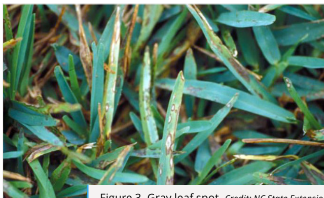
Figure 3. Gray leaf spot.

Gray leaf spot is a summer disease that can develop rapidly following prolonged periods of warm, wet conditions. Lush growth following heavy N applications or new establishment is particularly susceptible. Symptoms include tan or gray oblong lesions with purple to brown margins that can result in withering of large areas if severe. Gray leaf spot spreads by airborne spores and may have no distinct patches. When the disease is present, it is recommended that turfgrass clippings are bagged and removed to prevent it from spreading. Regular mowing can also help to remove susceptible new growth and keep the canopy open and airy. Generally, chemical control (fungicides) are not necessary to treat gray leaf spot in home lawns. Cultural management includes balancing fertility, avoiding high rates of soluble N, and deep and infrequent irrigation.