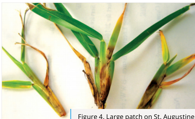
Figure 4. Large patch on St. Augustine.