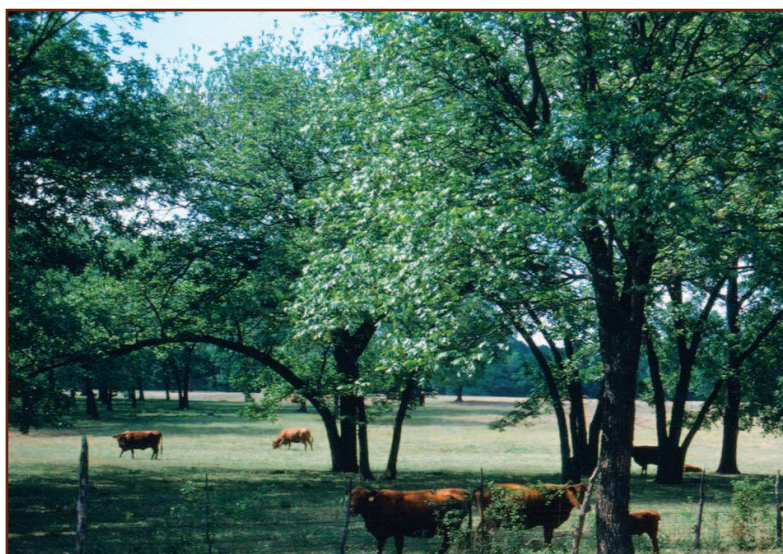
Figure 1. Grazing is an integral part of native pecan management; ideally, the animals should be removed 45 days before harvest.

When determining whether it would be economically feasible to improve your site, consider the soil depth, flooding potential, management options, pest control, and harvest requirements. A native pecan management program may include nut production as well as livestock grazing (Fig. 1) and recreational hunting.