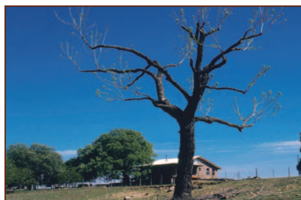
Figure 5. A native tree can be topworked (grafted) to an improved variety.