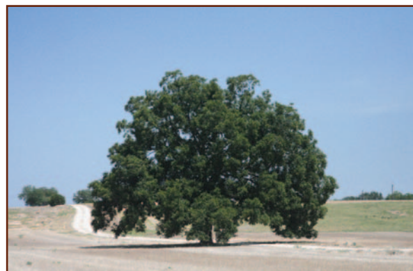
Figure 4. Isolated trees are vulnerable to birds and other nut eaters.