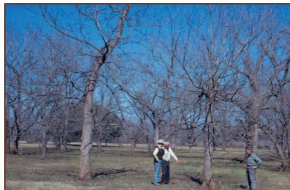
Figure 3. Weak trees should be removed early in the renovation process.

Grafted trees need more care than those not grafted. If you do not provide this care, the trees are better left as natives.