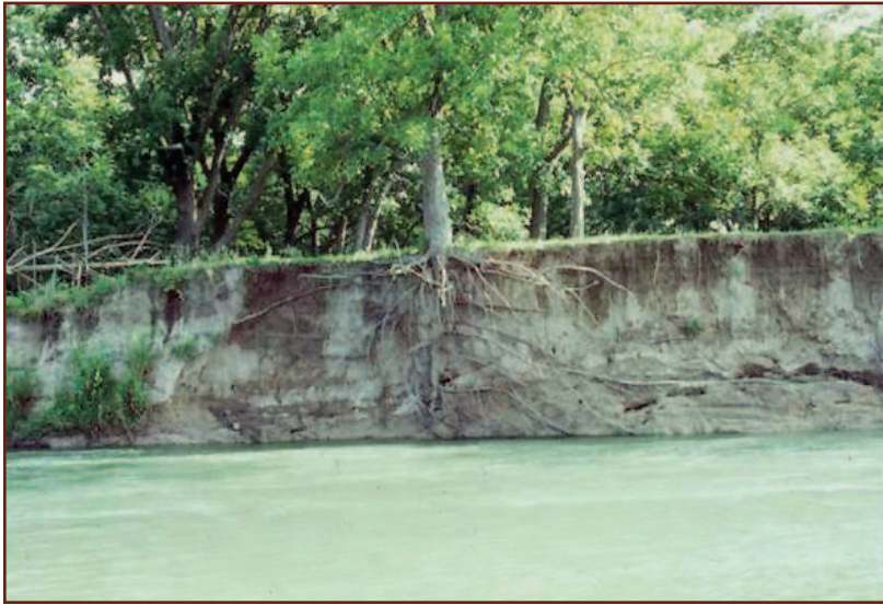
Figure 2. Deep soil is characteristic of native pecan bottoms.